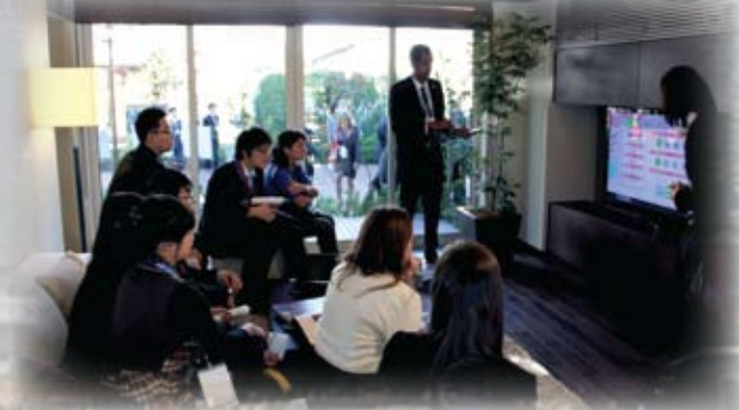
APEC Voices delegates watching a presentation on “Nissan New Mobility Concept” at the Nissan Showcase @ Home Collection.