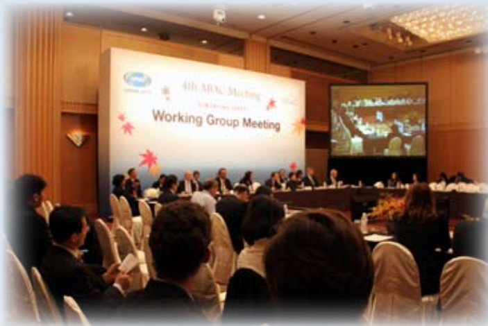
APEC Voices delegates attending the 4th APEC Business Advisory Council Meeting.

APEC Voices delegates attended the APEC SME Summit and ABAC Energy Forum as invited guests of the Support Council for ABAC Japan. They also attended the APEC Commemorative Symposium organized by the City of Yokohama at the Nissan Global Headquarters. The theme for the symposium was “Sustainable Development Supported by Women’s Advance into Society.” Again, it was very interesting for the APEC Voices delegates to be exposed to a different level of engagement at the event.