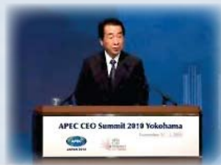
H.E. Naoto Kan, Prime Minister of Japan, addressing the APEC CEO Summit in Yokohama, Japan.

Additionally, over 100 APEC Voices delegates from 16 APEC Economies, namely Australia, Brunei Darussalam, Canada, People's Republic of China, Chinese Taipei, Hong Kong SAR, Indonesia, Japan, Korea, Mexico, New Zealand, Peru, Philippines, Russia, Singapore and the United States of America, gathered in Yokohama, Japan for the APEC Voices of the Future Program held in conjunction with the APEC Leaders' Meeting from 8 to 14 November 2010.