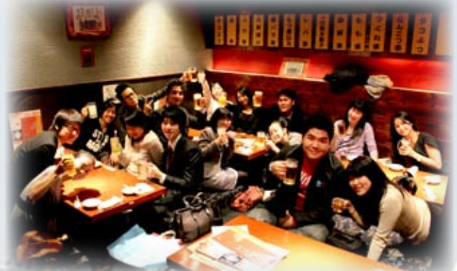
APEC Voices delegates enjoying warm fellowship and interaction during their stay in Yokohama.

"The APEC Voices Program further enhanced my analytical and critical thinking skills and helped prepare me to effectively respond to relevant challenges and issues in the Asia Pacific Region."