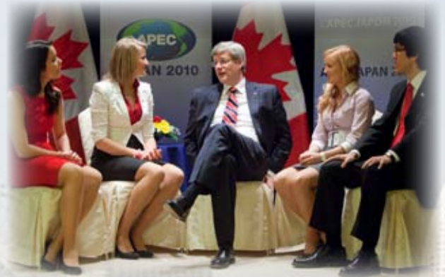
APEC Voices delegates from Canada interacting with H.E. Stephen Harper, Prime Minister of Canada.