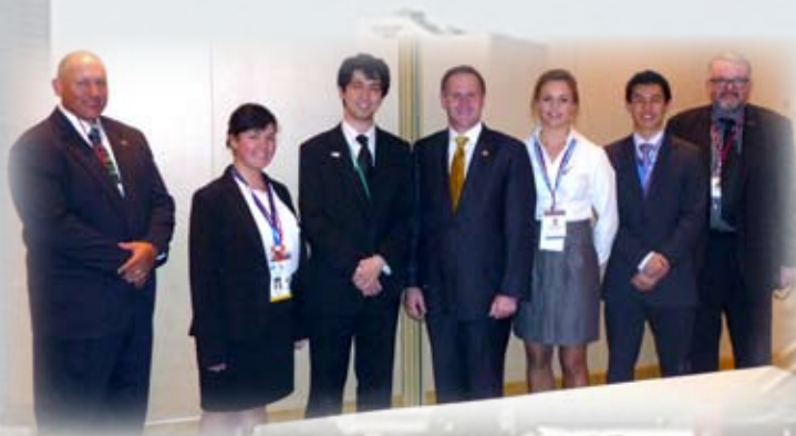
APEC Voices delegates from New Zealand with H.E. John Key, Prime Minister of New Zealand.