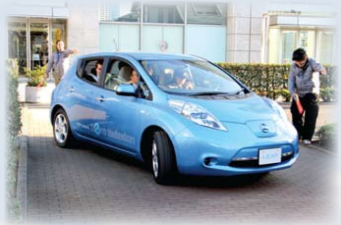
APEC Voices delegates test drive the Nissan’s pure electric vehicle, “LEAF.”

The delegates visited the Nissan Showcase @ Home Collection and were provided with the opportunity to go for a test drive of Nissan’s pure electric vehicle “LEAF,” which is powered only by electricity and operates on a battery that can be charged at home. The electric motor in “LEAF” replaces the conventional engine and offers a totally different driving experience with its quiet and responsive acceleration. Nissan LEAF will be introduced globally in the latter part of fiscal year 2010 as the world’s first mass-produced electric vehicle. The APEC Voices delegates were privileged to experience the LEAF before its introduction globally.