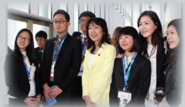
APEC Voices delegates with H.E. Makiko Kikuta, Parliamentary Vice Minister for Foreign Affairs of Japan.