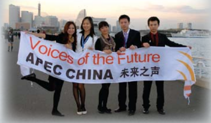
Members of the China Delegation at the APEC Voices 2010 in Yokohama.