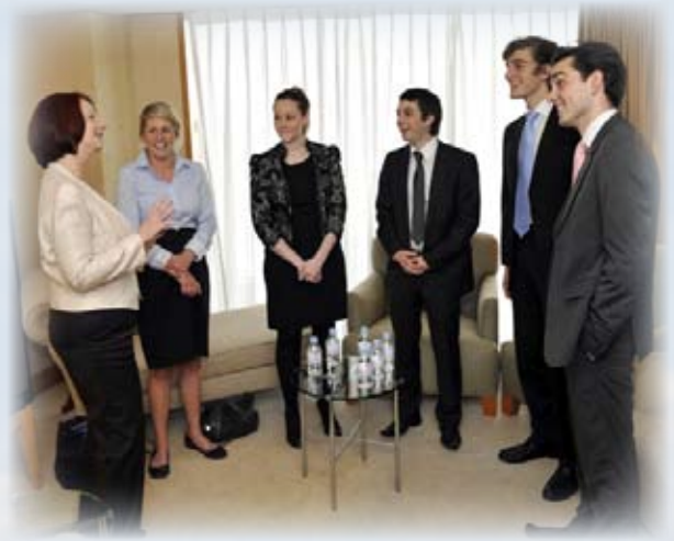
APEC Voices delegates from Australia meeting with H.E. Julia Gillard, Prime Minister of Australia.

During the summit, the youth delegates were provided with the opportunity to sit in the same ballroom with top CEOs and listen to the address by APEC Leaders on global economy such as: H.E. Naoto Kan, Prime Minister of Japan; H.E. Barack Obama, President of the United States of America; H.E. Lee Hsien Loong, Prime Minister of Singapore; H.E. Julia Gillard, Prime Minister of Australia; H.E. Felipe Calderon Hinojosa, President of the United Mexican States; H.E. Dr Sebastian Pinera Echenique, President of the Republic of Chile; H.E. Nguyen Minh Triet, President of the Socialist Republic of Vietnam; H.E. John Key, Prime Minister of New Zealand; H.E. Benigno S Aquino III, President of the Republic of the Philippines; H.E. Hu Jintao, President of the People's Republic of China; and many more. APEC Voices delegates were very excited, thrilled and honoured to be in the same room as the APEC Leaders. It was indeed an experience of a lifetime.