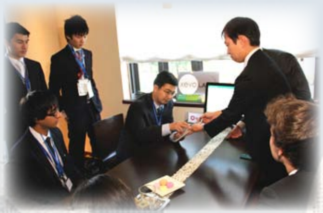
APEC Voices delegates interacting with a Nissan executive at the Nissan Showcase @ Home Collection.