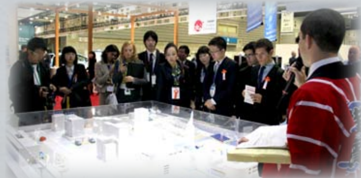
Youth leaders from 16 APEC Economies visiting the APEC Exhibition “Japan Experience” at Pacifico, Yokohama.

Another highlight on 9 November 2010 was a special visit to the APEC Exhibition “Japan Experience” for the APEC Leaders held at Pacifico, Yokohama. Specially arranged by the Ministry of Foreign Affairs of Japan, the visit to the APEC exhibition exposed APEC Voices delegates to Japanese technologies at their best. It was truly an eye-opener for the delegates.