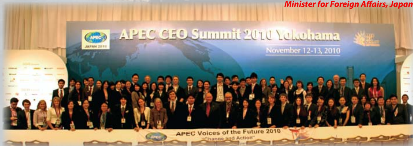
APEC Voices delegates at the APEC CEO Summit 2010, Yokohama, Japan.

H.E. Seiji Maehara Minister for Foreign Affairs, Japan