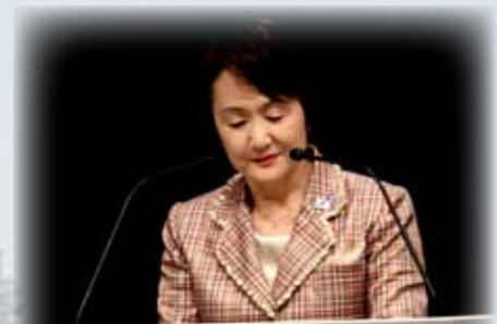
Fumiko Hayashi, Mayor of Yokohama, addressing the APEC Voices delegates at the Opening Ceremony.