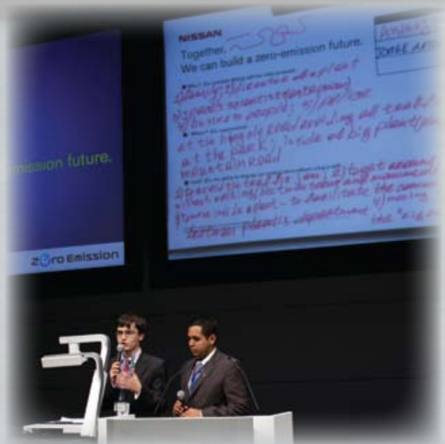
APEC Voices delegates providing feedback on Nissan LEAF to the Nissan management team.