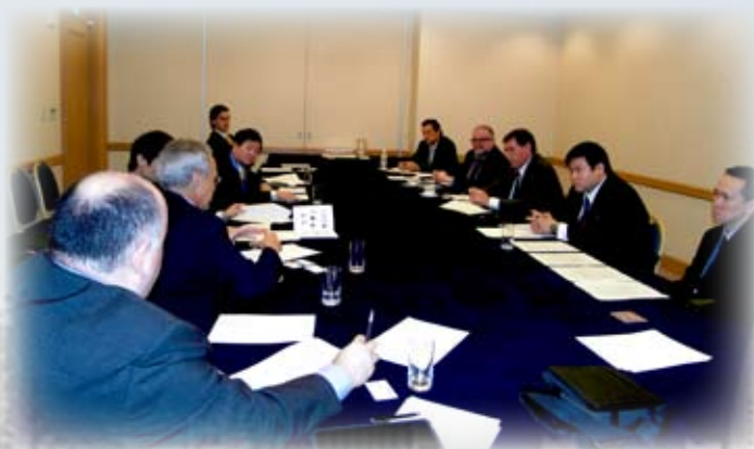
APEC Voices Leadership Board Meeting held at the Sheraton Bay Hotel, Yokohama.

“The Voices of the Future Program in Japan gave youth from APEC member economies a real-world experience. It provided an enhanced experience that developed young leaders into great global leaders of tomorrow.”