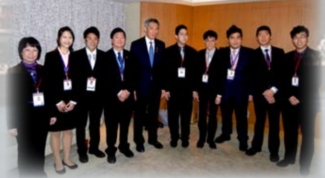
APEC Voices delegates from Singapore with H.E. Lee Hsien Loong, Prime Minister of Singapore.

"The Voices Program offers an unmatched opportunity to meet and share experiences with educators from the other member economies, and to serve in any way possible to broaden and deepen knowledge of the goals, institutions, and processes associated with APEC Voices leaders of the Pacific Rim."