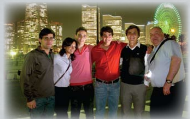
The Mexican delegates enjoying the beautiful night scene of Yokohama City.