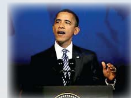
H.E. Barack Obama, President of the United States of America, addressing the APEC CEO Summit in Yokohama, Japan.

"It is my wish that APEC Voices delegates will make long-lasting friendships with your peers and learn more about the operations and important work of APEC."